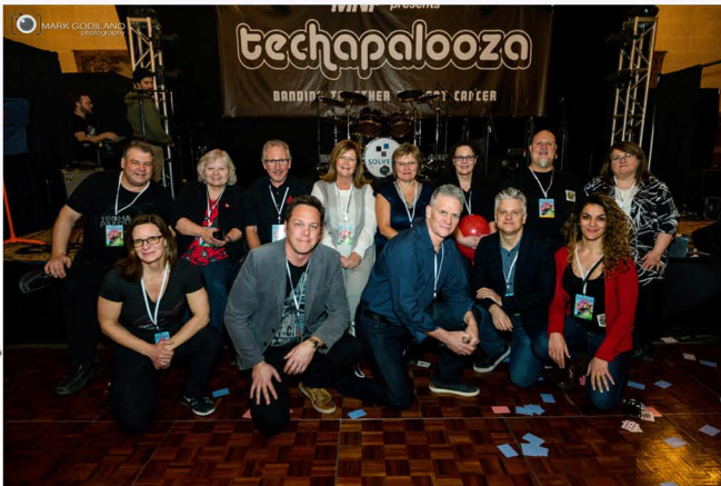
Techapalooza Committe - 2019